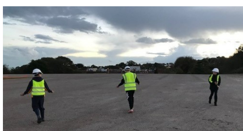
Members Talk and Seed Scattering at BSCC New Cricket Ground