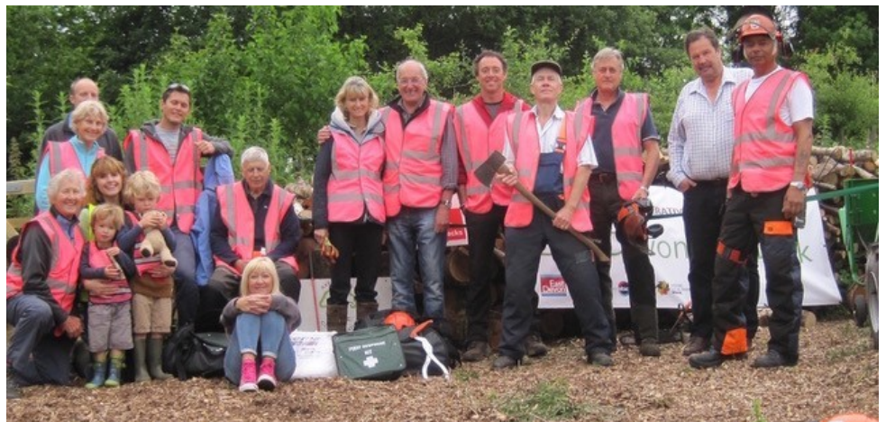
The Axewoods Team