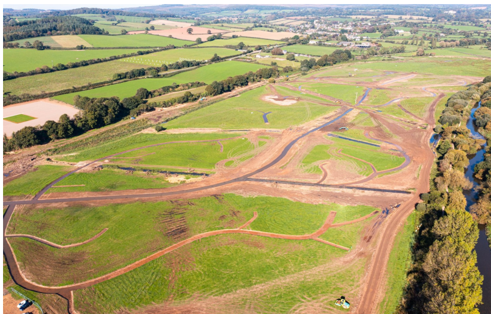
Creek Network Excavation North of South Farm Road